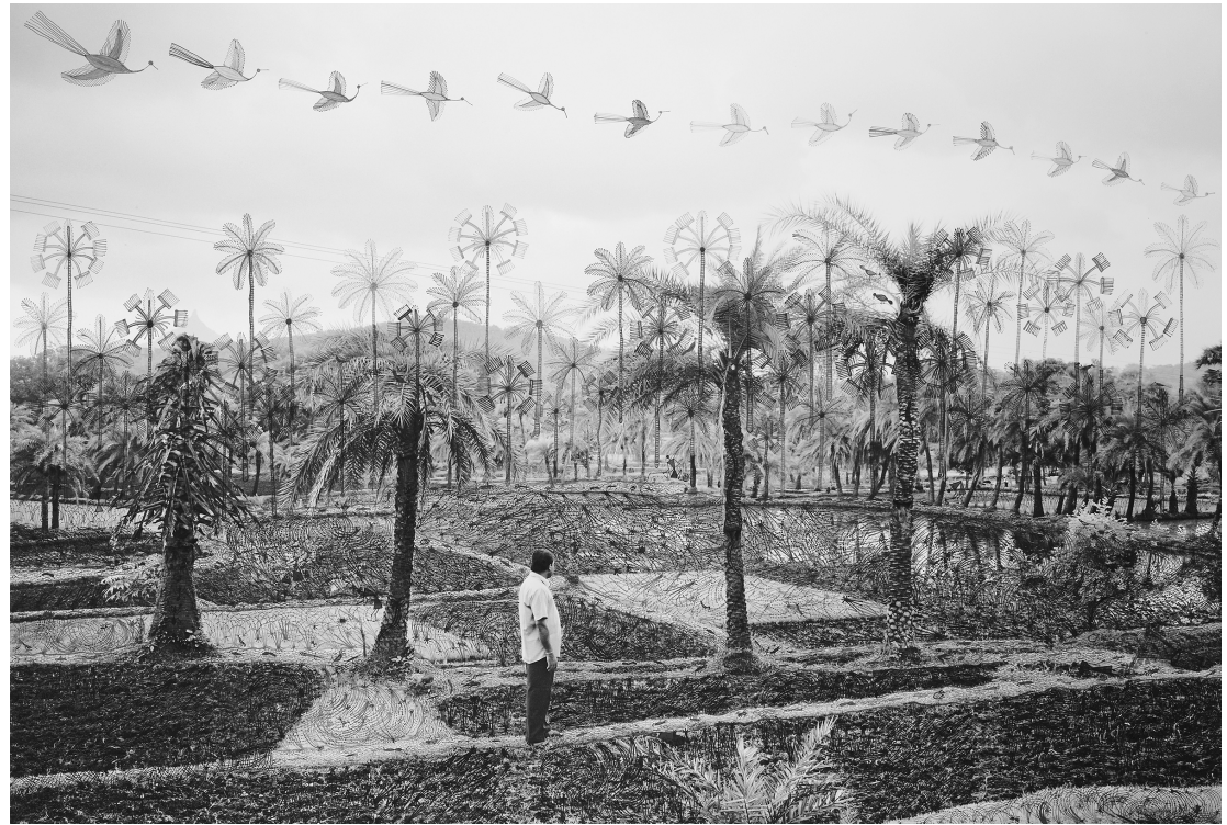
"Harvest II" , 2015

Gill's framings, which are vast and infrequently draw attention to the foreground, further open the immersive capacity of the works. In "Harvest II" and "River" among other works, her frames allow the viewer to move into their not-as-yet-visible depths in an imaginative resistance of rational time and photographic space. Challenging the conventionality of rural landscape-documentary photographs, a genre with rich colonial roots and touristic resonance, Gill's engagement with land is intimate, unexpected, and determined by Vangad's selection of spaces to memorialize. Defying the 'non-style' of the snapshot aesthetic, Gill and Vangad foreground aestheticism as a documentary proposition. They redirect the orientation of the artwork from the picturing of land to the experience of space. Through the depiction of sweeping receding fields within which Vangad is most often featured alone, Gill foregrounds the silence of the photograph, training a view on the 'nearness' of his lived experience, while still instantiating the insurmountable distance of representation.