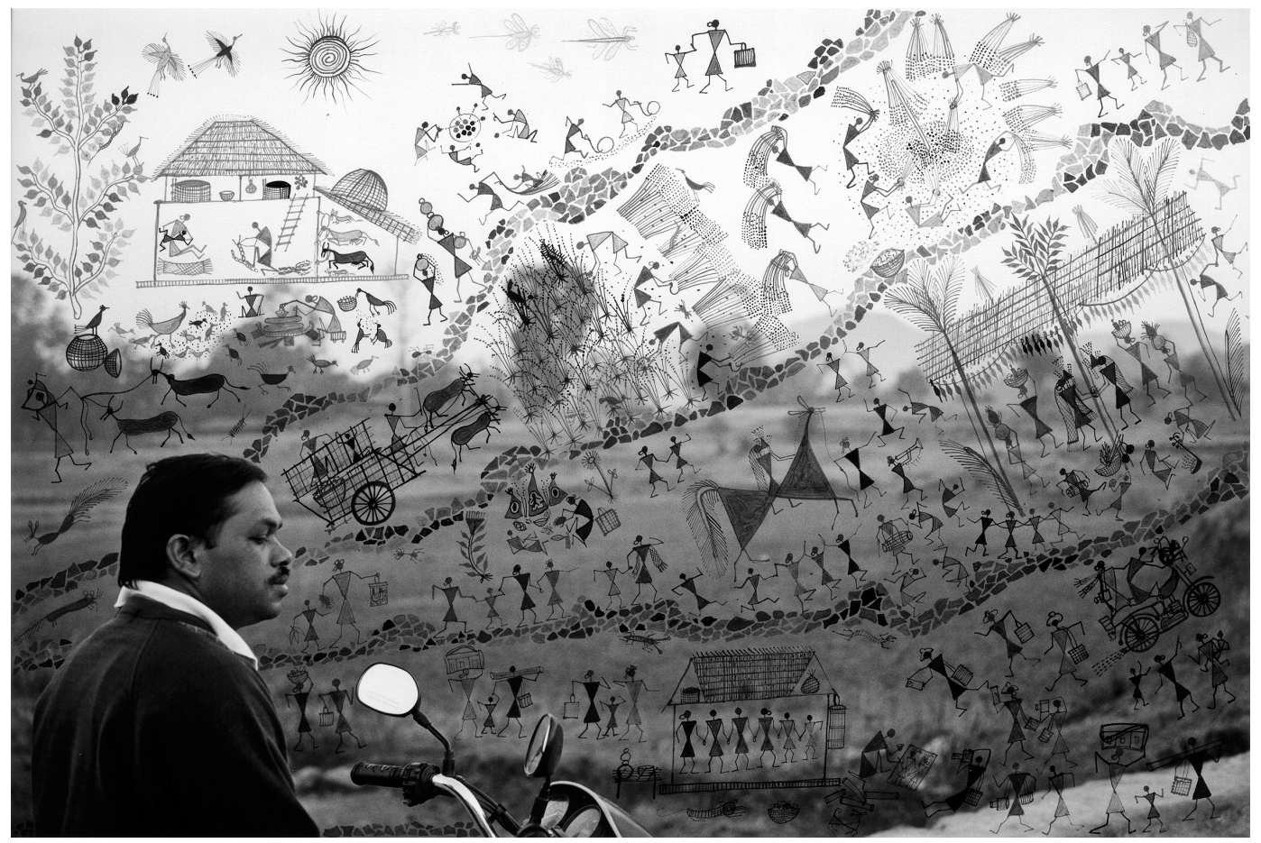
"Memories Come to Rajesh", 2014

In this essay, I argue that the series capitalizes on the distinct ontologies of Warli and landscape photographic traditions and their performances in the contemporary imagination, to construct alternative architectures of memory. I draw from the recent 'spatial turn' in visual cultural studies, which links the intellection of space (both physical and photographic) to the formation of personal, cultural, and body memory, to analyze how the artists redraw conventional lines between the photographic past and the present.