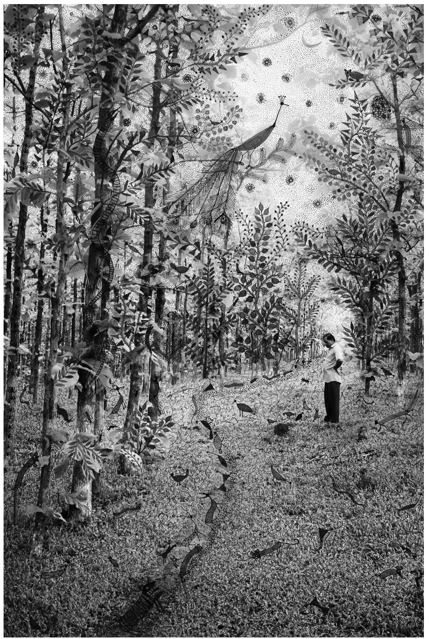
"Night Journey of Forest Dwellers", 2015

Similarly, in "Night Journey of Forest Dwellers" the artists deny the possibility of a singular reading through strategic renderings of space. The omnipresence of the forest dwellers, whose black outlines ground them within the pictured black and white landscape, suffuses the photograph with Vangad's memory of land – creating an atmosphere of Vangad's generation. His slight hunch takes on a proprietary attitude among the creatures, which both kindles my self-identification and its converse, my voyeuristic distance. As he looks down, I look down at the things that make themselves known to him (and to me), and the surreptitious creatures that are realized on the photographic form.