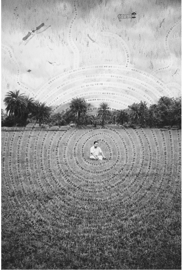
"Worship of the Great Serpent who lives in the Home of Ants", 2015